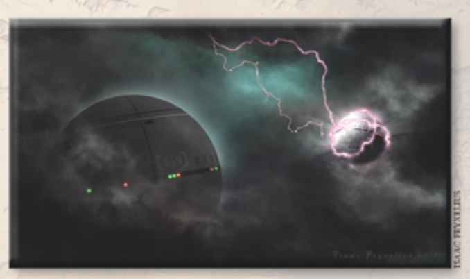
"All we need is more power" Bjorn Sigmund, ThorGate CEO

8 heat resources may be spent to increase temperature 1 step (and therefore also your TR 1 step).