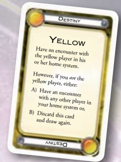
Sample Color Destiny Card

If the drawn card shows a player color, it indicates the planet system where the offense must have an encounter. For example, if the red player draws a green destiny card, the red player must have an encounter in the green system. The green player is the defense for this encounter.