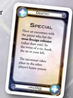
Sample Special Destiny Card

If the drawn card is a special, it will explain the conditions of the encounter. The player indicated by the destiny card is the defense for the encounter, and the card indicates where the encounter must take place. For purposes of game effects (such as the Shadow's execute ability), specials are treated as though the card showed the player color of the player designated as the defense.