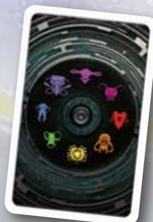
Destiny Card Back

The offense then draws the top card of the destiny deck. The destiny deck contains colors, wilds, and specials. If there is only one card left in the deck, do not draw it. Instead shuffle the final card and the destiny discard pile together to form a new destiny deck and draw from the new deck.