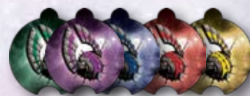
Player Colony Markers

These markers are placed on the track around the warp to record the players' progress towards winning the game.