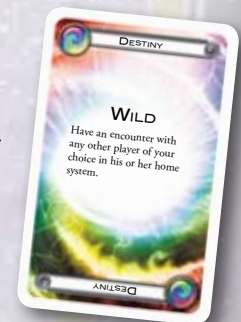
Sample Wild Destiny Card

If the drawn card is a wild, the offense may have an encounter with any player of his or her choice. For this encounter, the chosen player is the defense. The encounter must take place in the chosen player's home system.